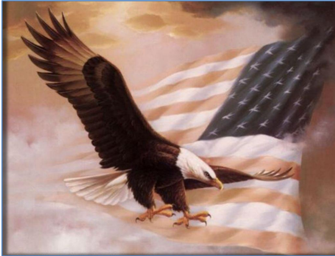
Atlanta Aerie 714 "SOARING EAGLE"